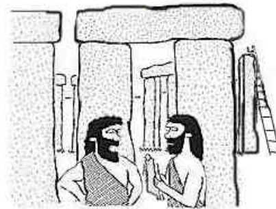
What! We need retrospective permission?

What it does show, however, is that by working together and being united we can have success at repelling inappropriate developments. From the evidence of our success, no-one should believe that there is no point in taking action because it won't make a difference – it does!